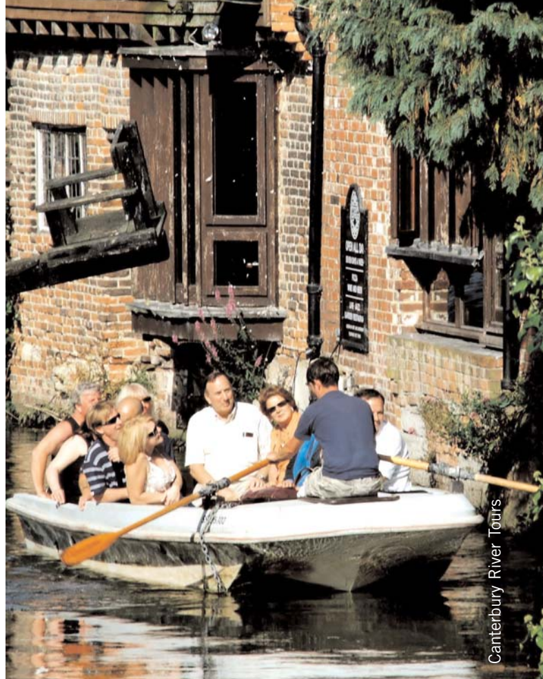
Canterbury River Tours