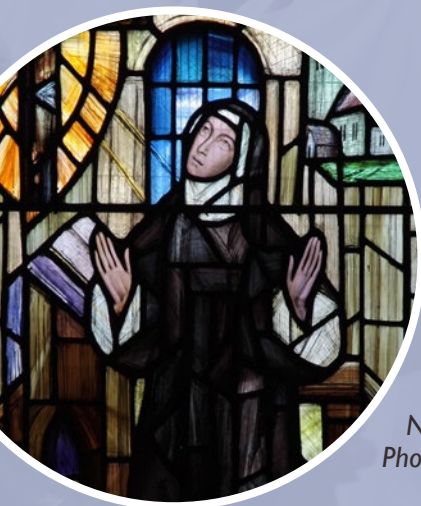
Source: Julian of Norwich